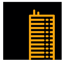
TANKING, FOUNDATIONS AND PLANTER BOXES