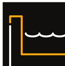
FISH PONDS, WATER FEATURES & WATER RETAINING STRUCTURES