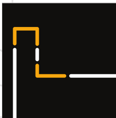
DETAIL WORK & MAINTENANCE ON TORCH-ON SYSTEMS

For use on concrete roof tiles, granular roof tiles, raw plaster and fibre cement surfaces